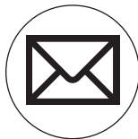
(66) Mail Post Office