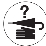
(65) Lost & Found