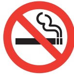
(103) No Smoking