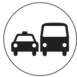
(21) Ground Transportation