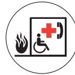
(125) Area of Rescue Assistance