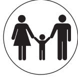
(46) Family Restroom