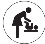
(48) Female Changing Table