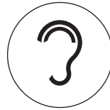
(123) Access for Hearing Loss