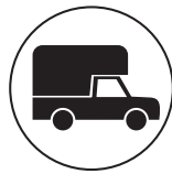
(31) Overheight Vehicle