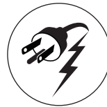
(71) Charging Station