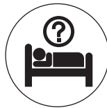
(63) Hotel Information