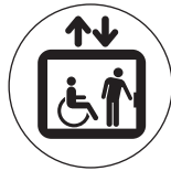
(126) Accessible Elevator