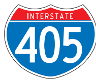
(37) MUTCD Interstate Route