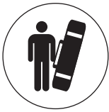
(14) Oversize Baggage