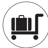
(68) Baggage Carts