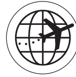
(4) International Arrivals