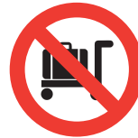
(112) No Baggage Carts