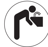
(56) Drinking Fountain