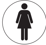
(42) Restroom, Women