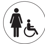
(51) Accessible Women's Restroom