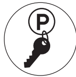
(35) Valet Parking