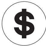
(62) ATM Cashier