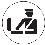
(5) Baggage Exam