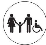
(52) Accessible Family Restroom