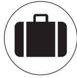
(1) Baggage Claim