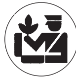
(7) Agriculture Exam