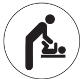
(49) Male Changing Table