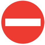
(105) No Entry