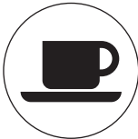
(82) Coffee Shop