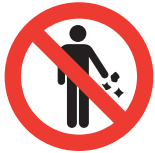
(113) No Littering