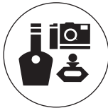
(90) Duty Free