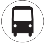
(26) CharterBus/ Scheduled Bus