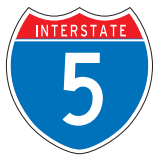
(38) MUTCD Interstate Route