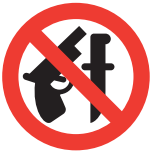
(109) Carry No Weapons or Bombs