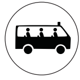
(36) Door-to-Door Vans