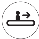
(130) Moving Walkway