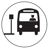
(25) Public Transit