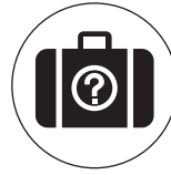
(3) Baggage Service