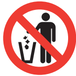
(110) No Waste Disposal