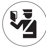
(6) Passport Control