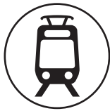
(30) Link Light Rail