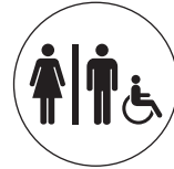
(44) Accessible Restroom