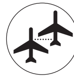
(11) Connecting Flights