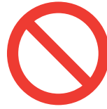
(104) Do Not/No