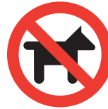
(108) No Pets