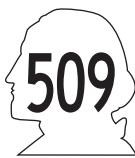
(39) MUTCD State Route