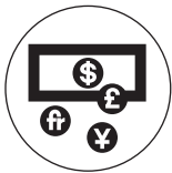
(61) Currency Exchange