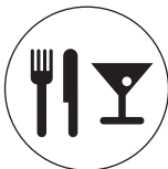
(89) Food Services