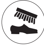
(88) Shoe Shine