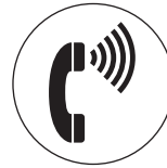
(124) Volume- Controlled Phone