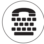
(122) Int'l TTY Symbol