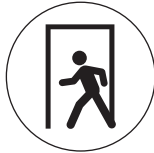
(114) Exit Access