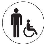
(50) Accessible Men's Restroom