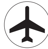
(12) Airport Flights