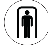
(8) Security Checkpoint