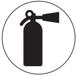
(101) Fire Extinguisher