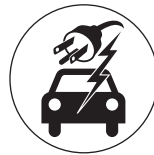
(72) Electric Car Charging Station