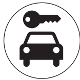
(22) Rental Cars