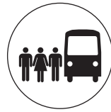
(13) Tour Groups