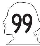
(40) MUTCD State Route

Note: Refer to MUTCD for other highway symbols