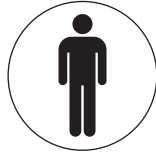
(41) Restroom, Men