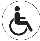
(121) ISA International Symbol of Access