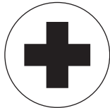
(54) First Aid