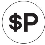
(32) Pay Stations