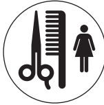
(87) Beauty Salon