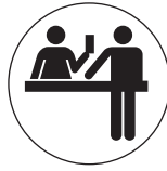
(2) Ticketing/ Check In