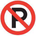
(107) No Parking