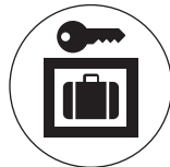
(58) Baggage Lockers